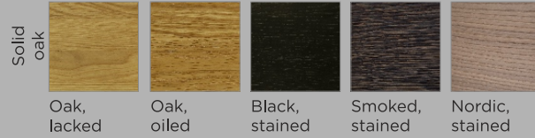
TABLE TOP COLOUR OPTIONS